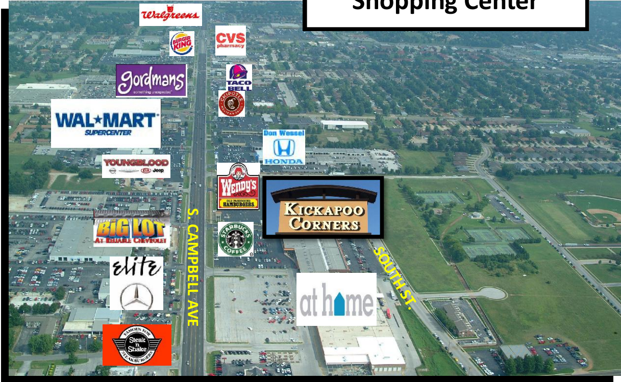
Kickapoo Corners View to the North