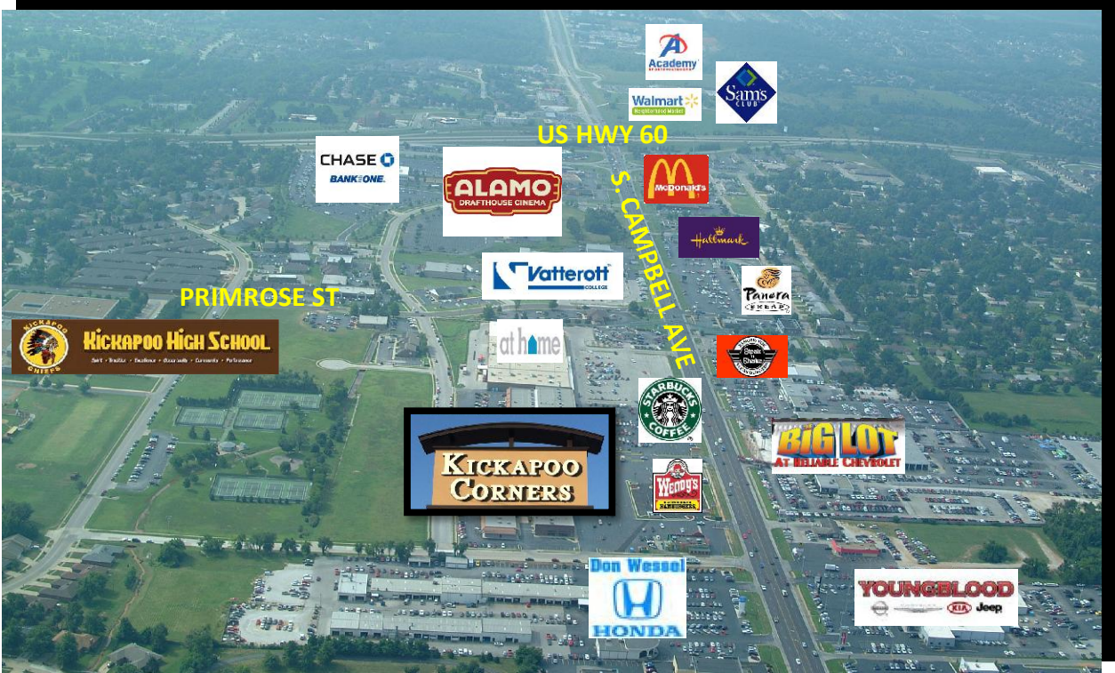
Kickapoo Corners View to the South